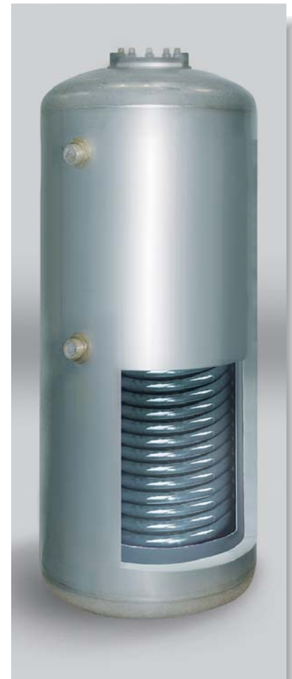
110 litre capacity, stainless steel cylinder