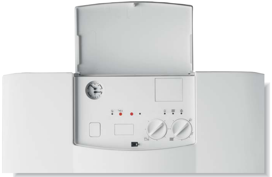
Detailed view of control panel

The temperature-pressure gauge shows the boiler temperature and pressure. As well as the various system power on, CH mode, burner on indicator leds, over 14 different led indicators highlight system problems at a glance, from: no water to a NTC sensor fault, giving peace of mind to the user and providing a diagnostic facility for the installer and service engineer.