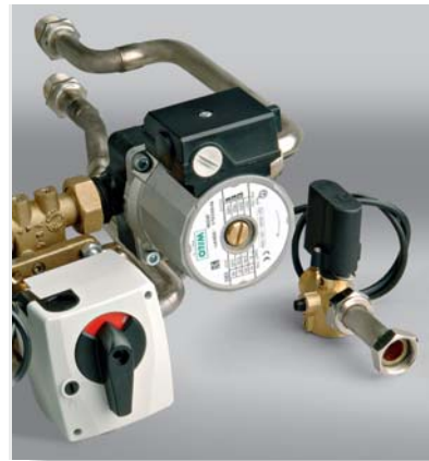
Mixing valve, pump group and electrical interception kit