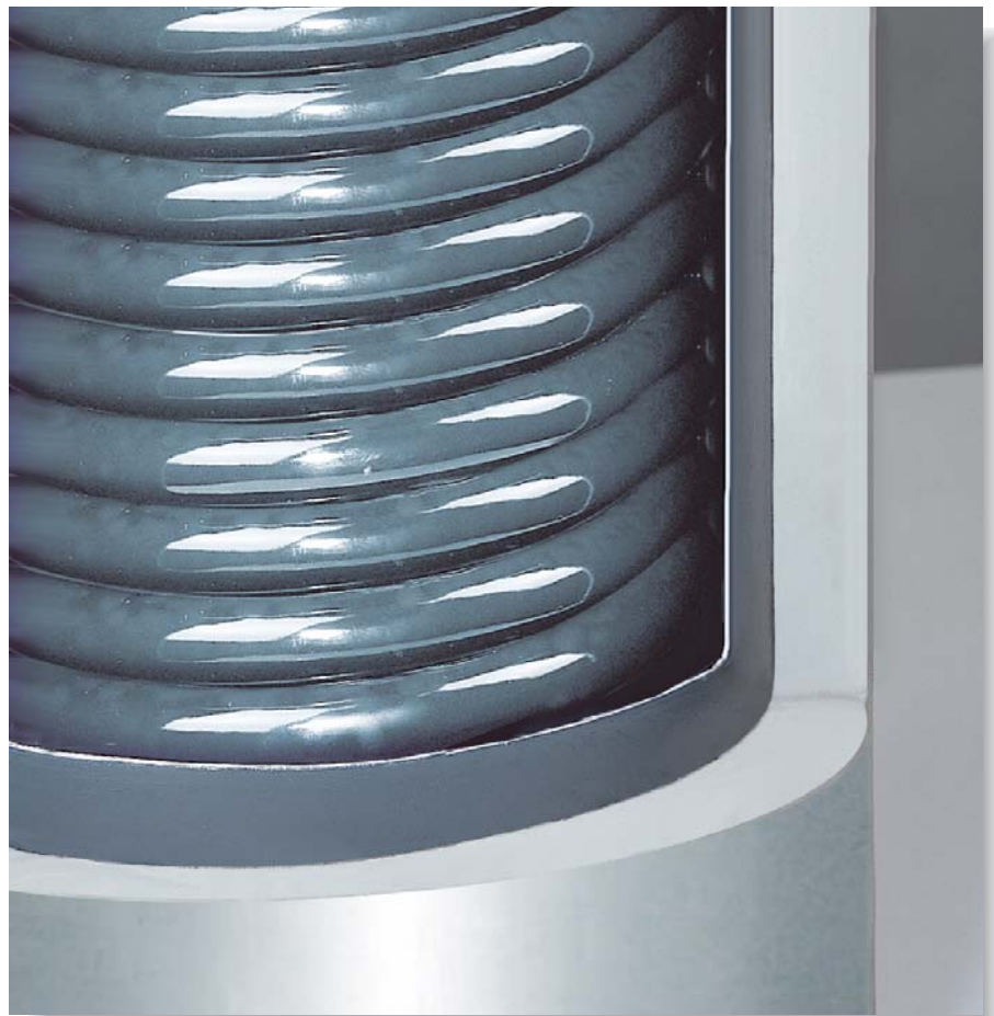
Stainless steel 110 litre storage cylinder

DHW production in 10 minutes – Storage cylinder at 60°C - Inlet water temperature 15°C